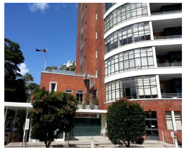
FIGURE 1. NON TRADITIONAL SUPERMARKET FORMATS

Woolworths, Bourke Street, Surry Hills, NSW